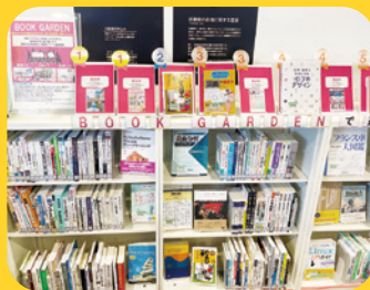
▲Shibaura: Beside the entrance