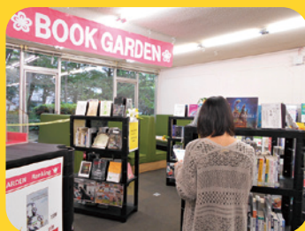
▲Omiya: In front of the PC area on the 1st floor