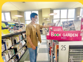
▲Toyosu: Book shelf No. 25

The Book Garden for the second semester will be held on the 11th, 16th, and 18th of November!