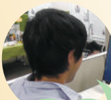
I 1st grade Undergraduate, Bioscience and Engineering

I've used Newspaper database such as Nikkei, Asahi and Yomiuri, frequently. It's easy to find articles by keywords.