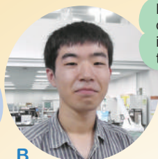
B 2nd grade Undergraduate, Bioscience and Engineering

I often use database such as SciFinder and Scopus in my study. As for E-J, I use ScienceDirect etc., also I've used E-book. It was very useful when the book I want to read was rented out.