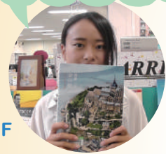
F 4th grade Undergraduate, Environment systems

I used database when I wrote my graduation work. I've searched on previous research through CiNii.