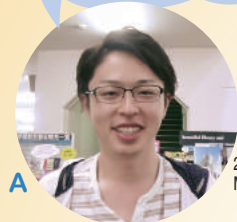
A 2nd grade Graduate School, Major in Mechanical Engineering

I've used Yomiuri database for my report. It is useful. I knew about database at the guidance. When I was a high school student, we didn't have this kind of service.