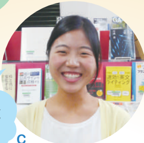
C 2nd grade Undergraduate, Applied Chemistry

I use database in my PC. What database can do in smart phone is provide a more accessibly way to get information in everywhere.