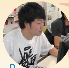
D 1st grade Undergraduate, Applied Chemistry

I've used Yomiuri database for my report. It is useful. I knew about database at the guidance. When I was a high school student, we didn't have this kind of service.