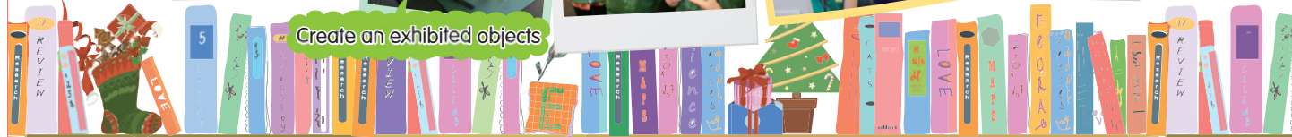
Create an exhibited objects