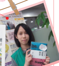
Write a promotion item