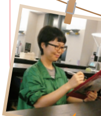
Patrol the library