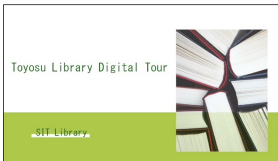
Toyosu Library Digital Tour

How to Find Research Papers The Basic Guide of SIT Library Library guide for new faculty members