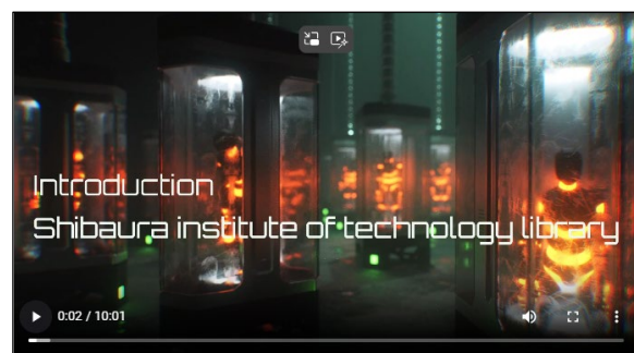
Omiya Library Digital Tour