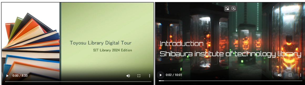
Toyosu Library Digital Tour